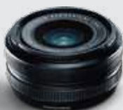
XF18mm F2R $899