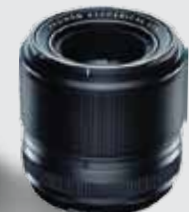
XF60mm F2.4R Macro $999