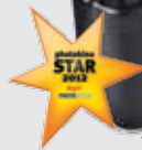
*Comes in Black & Silver