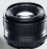
XF35mm F1.4R $899