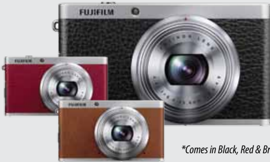
*Comes in Black, Red & Brown