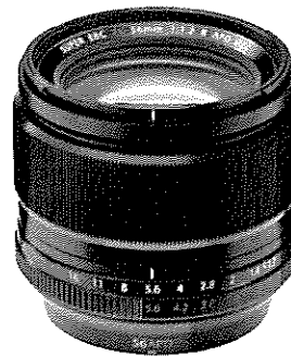
XF56mm F1.2R APD