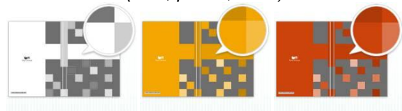
Mosaic monotone (white, mustard, terracotta)