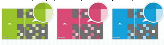
Mosaic colored (leaf green, rose red, sky blue)