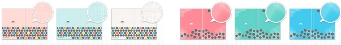
Dots (ivory, powder pink, baby blue)